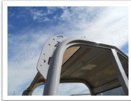
Photographs are for illustrative purposes only. Functions, layout, engines and bodies will vary between models